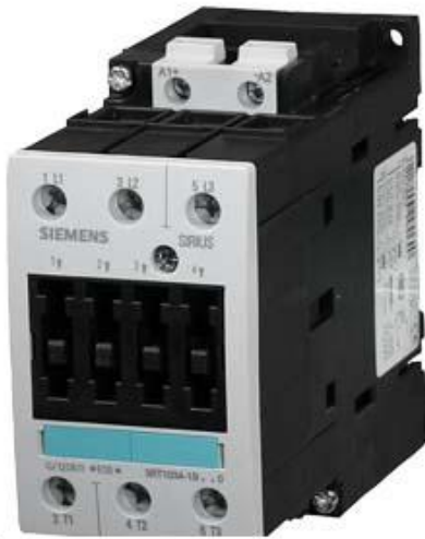
CONTACTOR, AC-3 15 KW/400 V, DC 24 V, 3-POLE, SIZE S2, SCREW CONNECTION